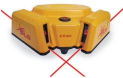
PLS FT 90