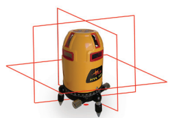
PLS HVL 100